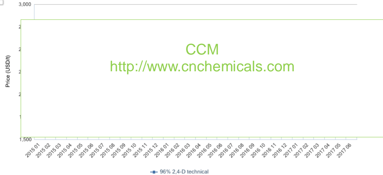
Figure 2.2-1 Ex-works prices of 2,4-D 96% technical in China, Jan. 2015–June 2017

The ex-works price trends of the 33 herbicide technical products in China between Jan. 2015–June 2017 are given below.